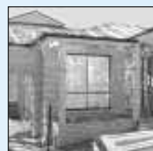
Low mortgage rates