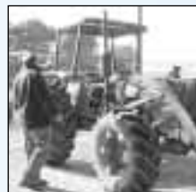
Assisting the bush