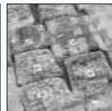
Record drug seizures