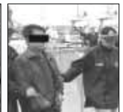
Securing our borders