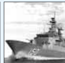
More defence funding